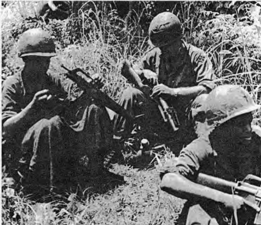
GROOM AND CLEAN —Two members of a 1st Battalion, 14th Infantry patrol sit and clean their weapons while a third member pulls security for the group. Constantly alert the infantryman knows that Charlie can strike at any moment.