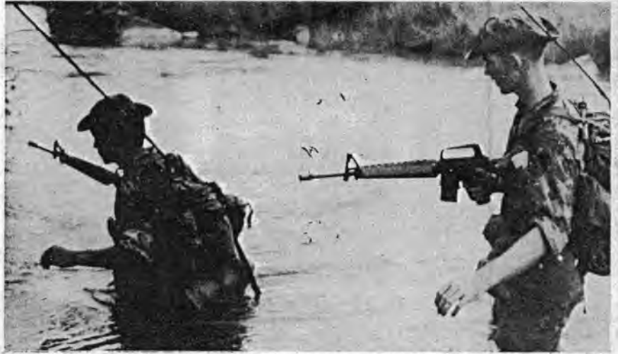
ALWAYS OBSTACLES —These First Brigade Rangers cross this river in the Central Highlands with little trouble. They are trained to overcome whatever obstacles might be in their way and interrupt the completion of their mission.

"Soldiers in Vietnam must find the strength to endure from somewhere deep inside themselves to face the task ahead. A task their country asks of them to protect the liberties we hold so dear."