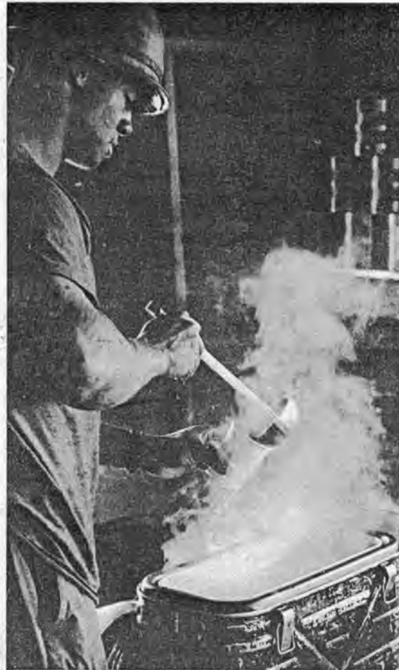
HOT BREW —A Famous Fighting Fourth Division soldier pours himself a cup of steaming hot chocolate, a drink that sure goes good on a windy monsoon morning.

Two infantry elements swept both sets of bunkers after the gunships left the area, but found the positions deserted.