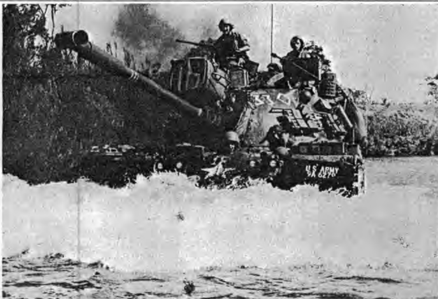
TANK POWER —A 1st Battalion, 69th Armor tank makes a few waves as it plows through a river near An Khe while on a search mission in the Central Highlands. The big tanks of the Famous Fighting Fourth Division keep Charlie on the move.

"The actions of the Fourth Infantry Division during these operations," wrote Colonel Lien, "demonstrated exceptional professional skill, determination and enthusiasm in overcoming the adverse enemy and weather conditions, to soundly defeat the hostile forces. Their actions were in keeping with the highest tradition of the military service."